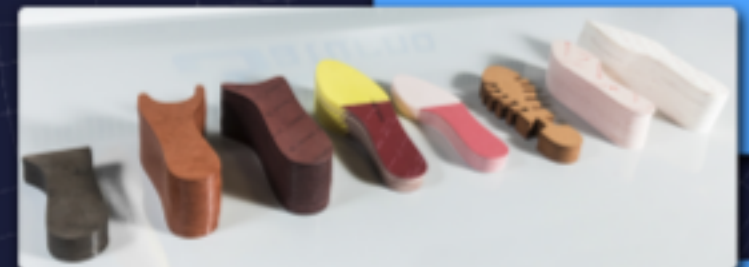
INSOLES HIGH PRODUCTIONS

Saturno 3 by its double head system, ensures high productivity while the rigid cutting table allows a perfectly uniform and high quality processing on both sides of the cut pieces. The objective to reach a perfect cut of the pattern has been achieved by the mechanical locking system also. This technology, based on the pressure in several areas of the material, allows set to zero the high energy consumption and to save a lot of power in comparison to the vacuum system. Product design and selection of working programs can be performed by simple operations using our "leacad" software. The new generation technologies used, such as the processor and the new digital CNC control, place Saturno 3 at the top of automatic cutting systems available today on the world market.