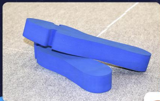
VERY HIGH QUALITY CUTTING ON MICRO